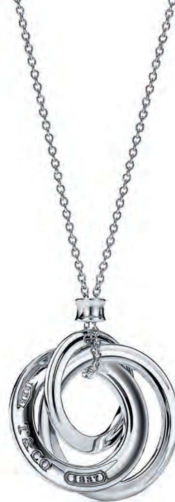
RETURN TO TIFFANY®, TIFFANY 1837®, TIFFANY INFINITY Designs in sterling silver, from left: Return to Tiffany® circle edge cuff, from $400. Tiffany 1837® narrow cuff, from $300. Tiffany Infinity cuff, $400. Tiffany 1837® interlocking circles pendant, $285.